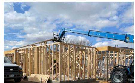
PAGE 2 | 904 SE 21ST