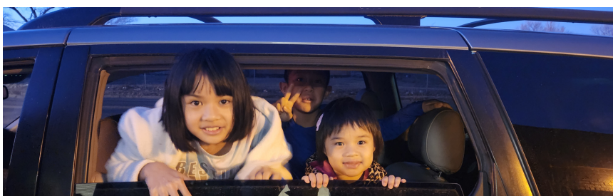
PAGE 3 | DRIVE-THRU CHRISTMAS 2022