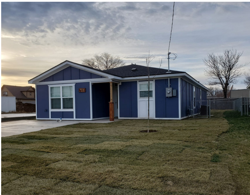
PAGE 2 | 902 SE 21ST

WE ARE PROUD TO INTRODUCE OUR NEW DEVELOPMENT DIRECTOR!